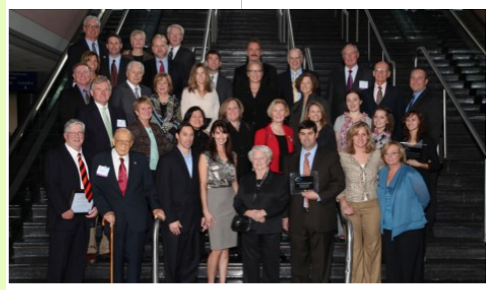
2011 National Philanthropy Day honorees.

—Gretchen Wood National Philanthropy Day 2012 Chair